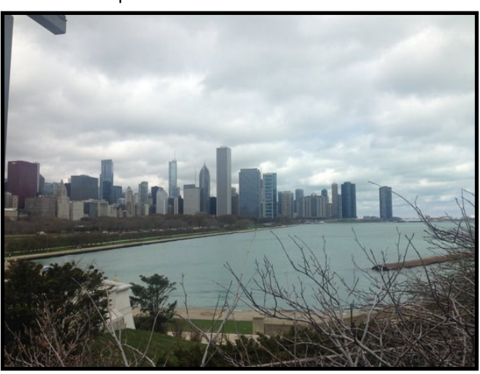
Saturday was the big day! A Windy City skyline view as the Garretson High School Band and Choir

The trip was a great success and experi-